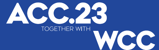
ACC23 Lock Up_Wide_WHITE.eps