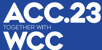
ACC23 Lock Up_WHITE.eps