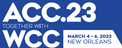
ACC23 Lock Up_With Date_White.eps

Logos are available for download at www.expo.acc.org (login required).