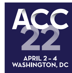
ACC22 Logo Lockup_Square.eps